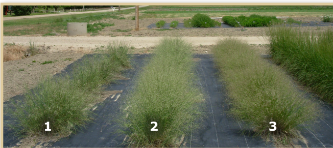
Nezpar (1), Rimrock (2), White River (3) Indian Ricegrass

elevation is about 5,400 ft. Thirty-two lines were selected from PI 232329 based on high germinability and seed yield, and these lines were bulked to form White River. It is anticipated that White River will be used in the Upper Colorado Plateau of eastern Utah and western Colorado and the Basin Province of southern Wyoming.